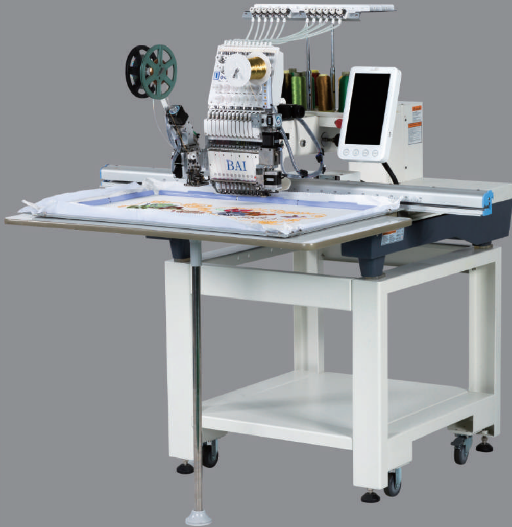
+ cording device